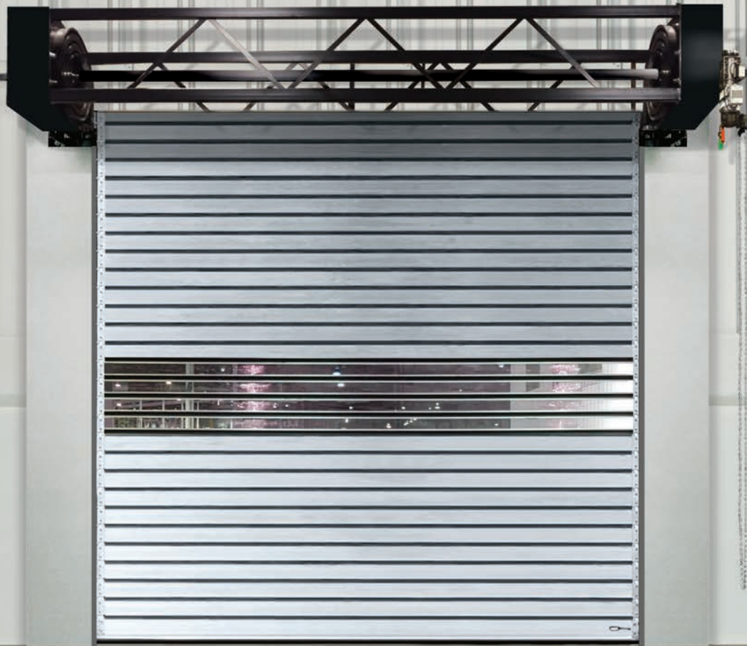
RapidShield® Model 998 with optional vision slats