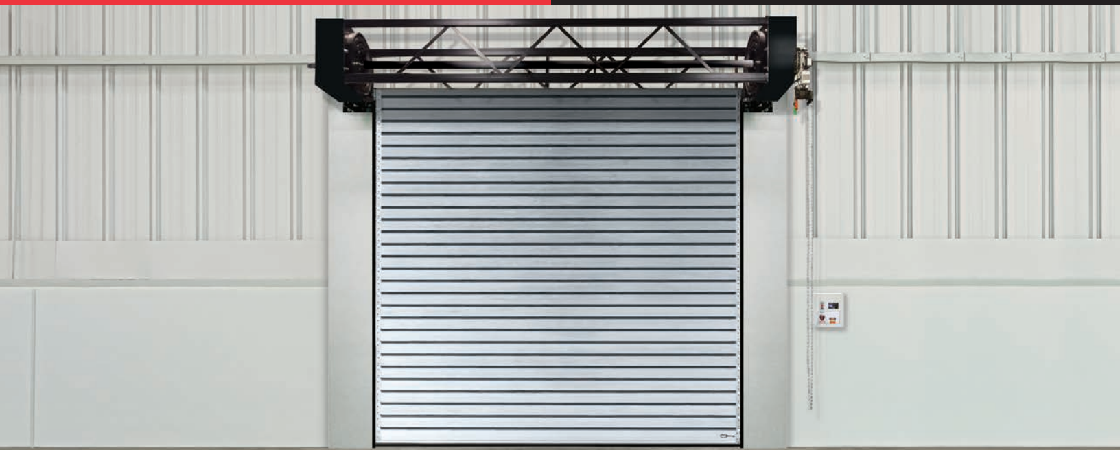
RapidShield® Model 998